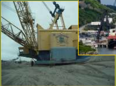
Flywheels: Legacy & Modern